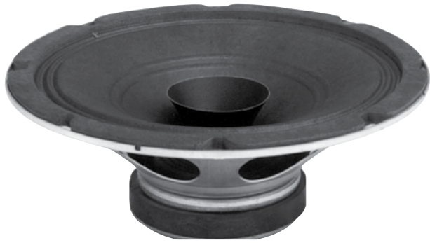
D Series (C10A Series Speaker)