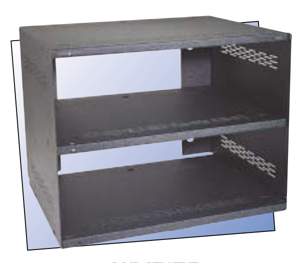
WME150 Shown assembled without door