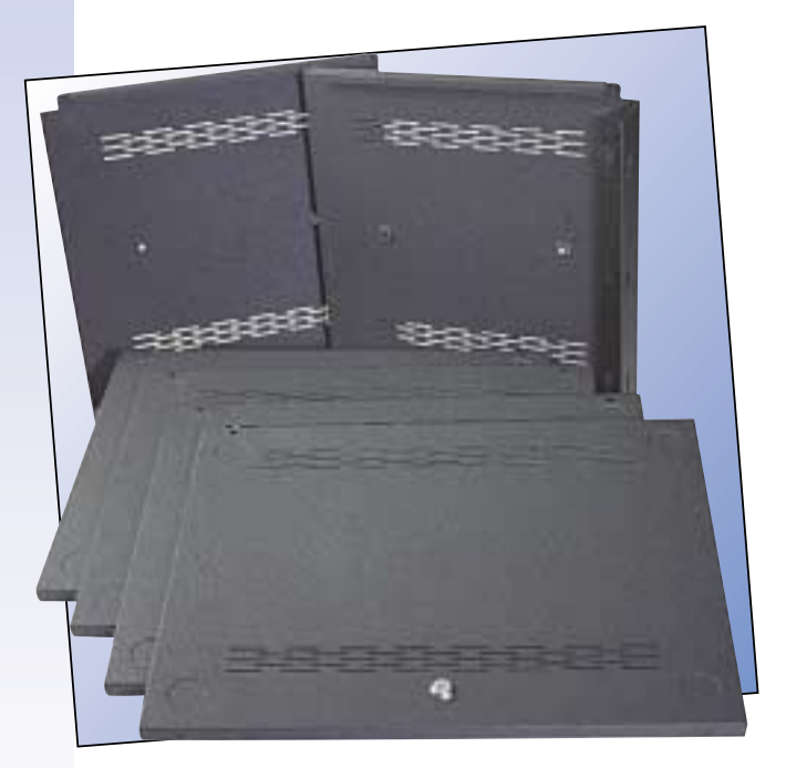
WME150 Unassembled system