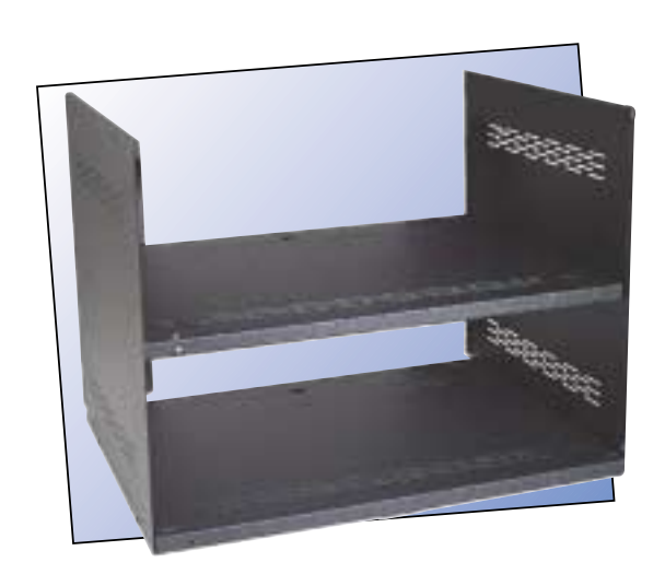
WME150 Shown assembled without door and without top panel